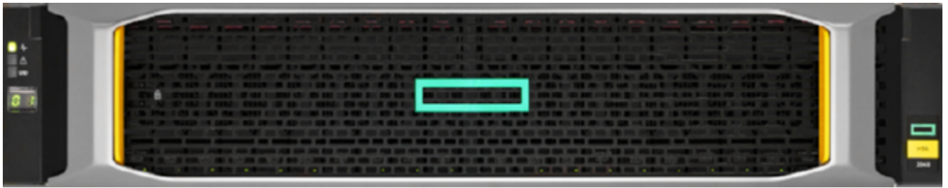
HPE MSA 2060 Storage

The HPE MSA 2060 is a flash-ready hybrid storage system designed to deliver hands-free, affordable application acceleration for small and remote office deployments. Don't let the low cost fool you. It gives you the combination of simplicity, flexibility, and advanced features you may not expect in an entry-priced array. Start small and scale as needed with any combination of solid state drives (SSDs), high-performance Enterprise SAS HDDs, or lower-cost Midline SAS HDDs. With the ability to deliver 325,000 IOPS, the new MSA 2060 is up to 45% faster than its prior generation with ample horsepower for even the most demanding workloads.