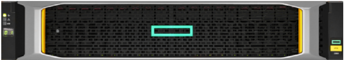
HPE MSA 1060 Storage

Designed to meet entry-level storage requirements, the HPE MSA 1060 Storage is a good fit for budget constrained customers. With one of the lowest entry price points in the Hewlett Packard Enterprise Storage portfolio and field-proven HPE ProLiant compatibility, the HPE MSA 1060 Storage is the platform of choice for smaller IT workloads. The HPE MSA 1060 Storage features 10GBASE-T iSCSI, Fibre Channel and SAS host interface connectivity at previously unattainable entry price points. The MSA 1060 allows users to take advantage of the latest storage technologies while also providing a balance between performance and budget.